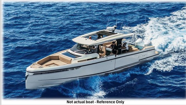
Not actual boat - Reference Only