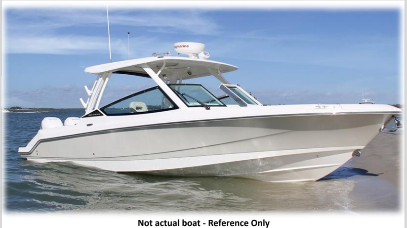
Not actual boat - Reference Only

2026 Boston Whaler 280 Vantage 09/04/2026 ORDEN:2815504