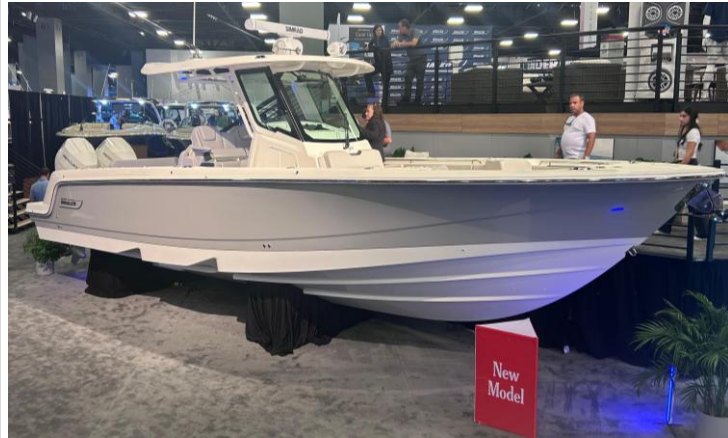
Not actual boat - Reference Only