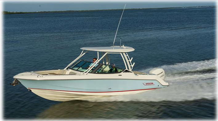
Not actual boat - Reference Only