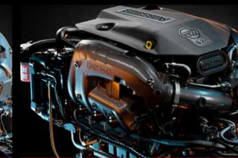
MALIBU MONSOON M6 6.2 L DIRECT INJECTED TORQUE - 460 FT-LBS @ 3800 rpm POWER - 430 HP @ 5600 rpm