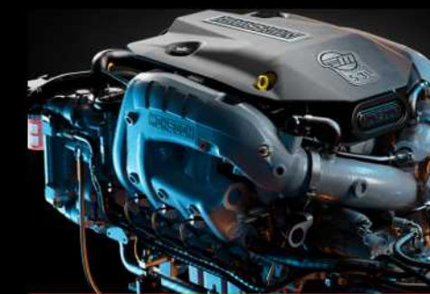
MALIBU MONSOON M5 5.3L DIRECT INJECTED TORQUE - 400 FT-LBS @ 3800 rpm POWER - 360 HP @ 5600 rpm

*Some features shown or described are optional and may not be included as standard equipment. Availability and specifications are subject to change. See your authorized dealer for details.