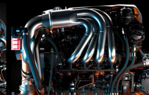
MALIBU MONSOON LT4 6.2L DIRECT INJECTED TORQUE - 670 FT-LBS @ 3800 rpm POWER - 652 HP @ 5600 rpm