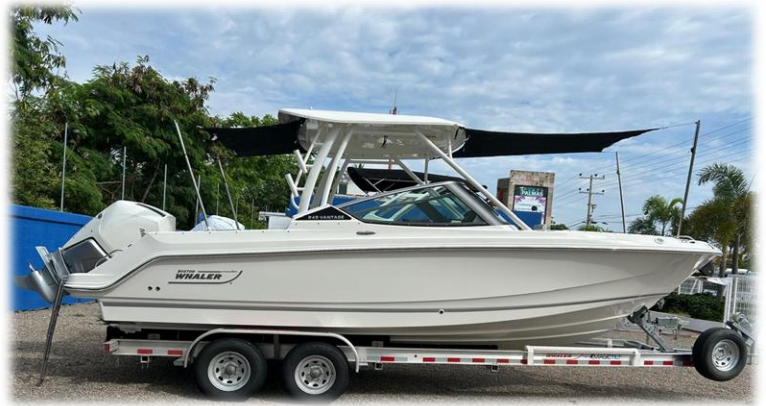
Not actual boat - Reference Only